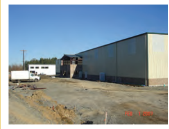
New construction in Four Corners Industrial Park.