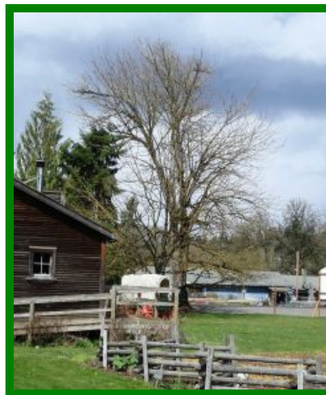
Maple # 3