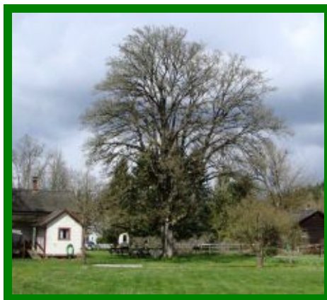
Maple # 2