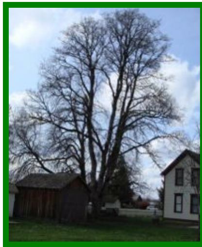
Maple # 1