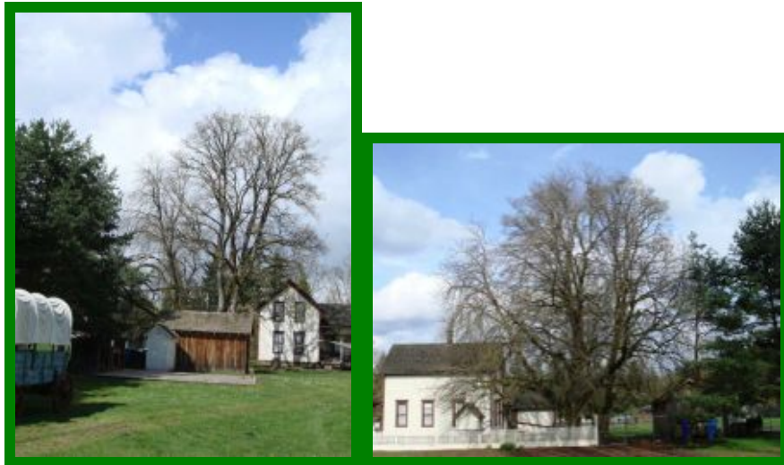
Horse-chestnut # 1