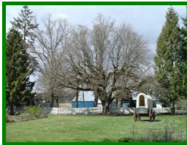
Horse-chestnut # 2