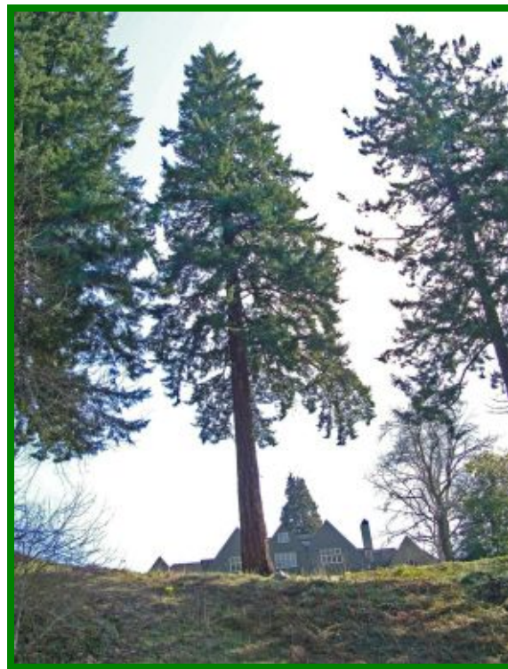
Douglas fir 4