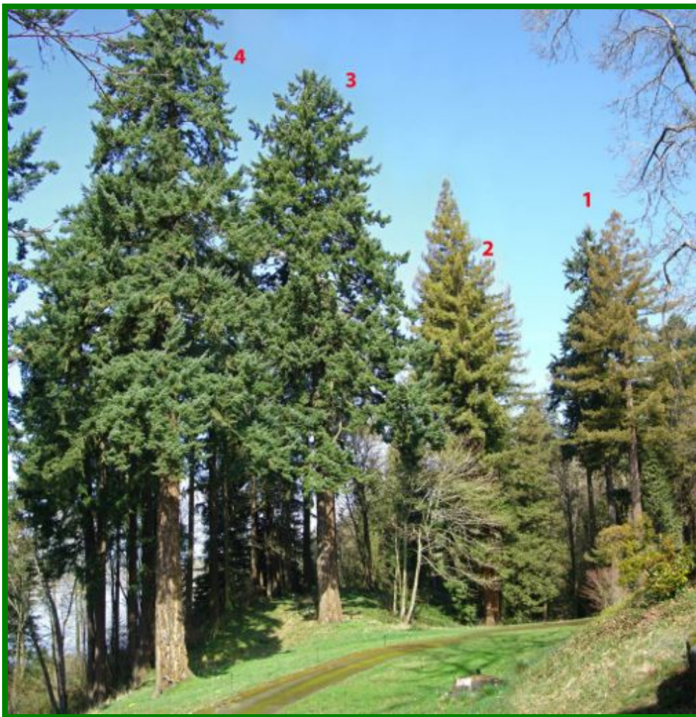
1 & 2 Coast redwood, 3 & 4 Douglas fir