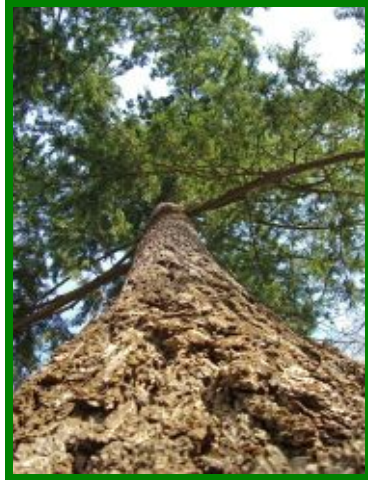
Douglas fir 5 – near the Willamette River