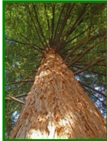
Coast redwood 1