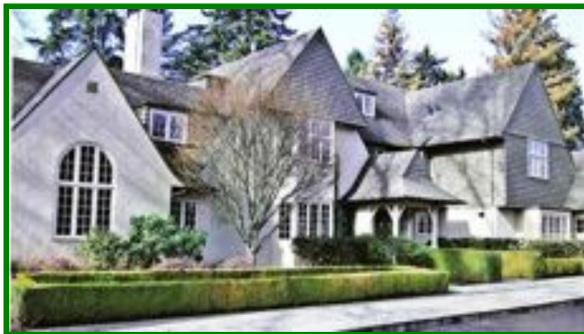
William and Irene Finley Residence, Arts and Crafts, built 1920 Clackamas County Historic Landmark