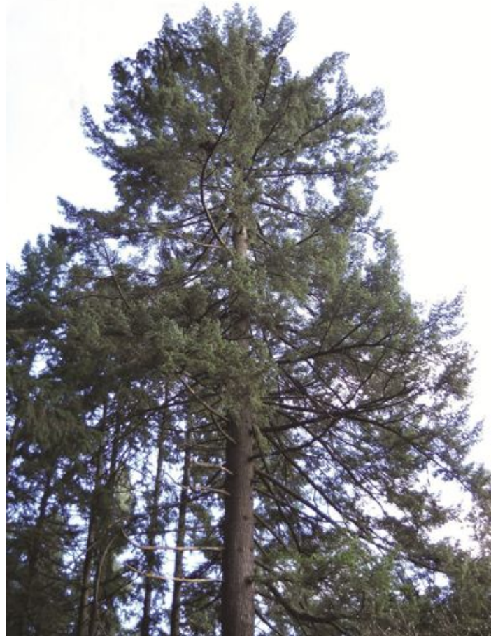
Right: Canopy view

This tree is nominated and approved under the Heritage Tree category of specimen.